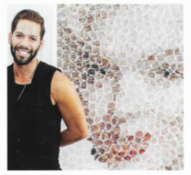
MUSICIAN FRANKIE SILVER